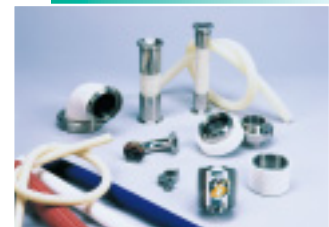
COMPLETE RANGE OF FITTINGS AND FLEXIBLE HOSES