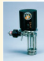
AUTOMATIC PURGING DEVICE

• All type of special units upon request.