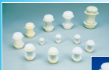
A COMPLETE RANGE OF BI-DIRECTIONAL PIGS