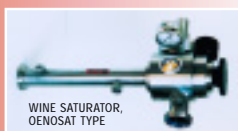
WINE SATURATOR, OENOSAT TYPE