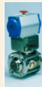
IN-LINE STERILIZING MODULATIVE VALVE