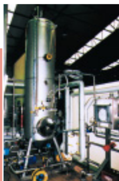
DEAERATION OF LIQUID