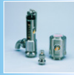
PRESSURE AND VACUUM SAFETY VALVES, SDD AND SDE TYPES