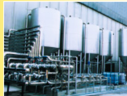
CLEANING IN PLACE UNIT (CIP).