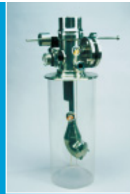
VERTICAL TANK TOP PIPES